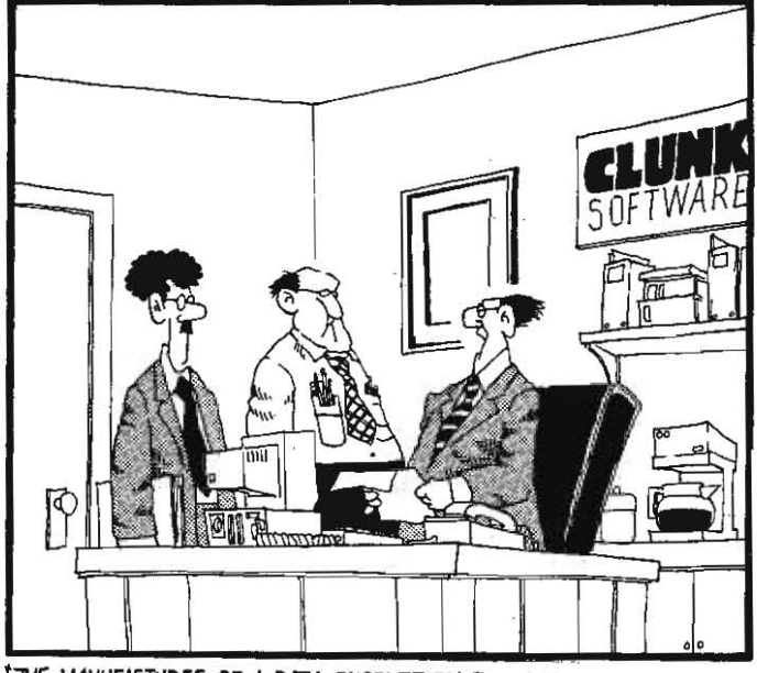
THE MANUFACTURES OF A DATA ENCRYPTION PROGRAM THAT SCRAMBLES MESSAGES INTO A BRAINLESS MORASS OF INDECIPHERABLE CODE, HAS JUST FILED A 'LOOK AND FEEL' COPYRIGHT SUIT AGAINST OUR LANGUAGE ARTS SOFTWARE."

While the Dynamo is primarily an assembly language tool which is currently limited to Apple's Macintosh-based MPW development environment, it does provide a development functionality that has not been present for the 8-bit Apple II systems and should ease the task of writing large applications for these systems.—DJD